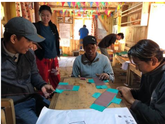
Men who sew sanitary