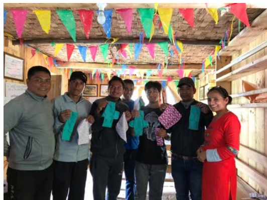
With the help of funding from the